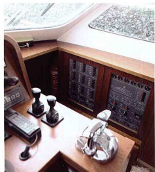
The electrical switches provided by Mastervolt match the MasterVision design and colour scheme superbly. Switches and panels are also suitable for outdoor use. Pictured a combined AC and DC switchboard on-board a 50 ft motoryacht.

Every electric switch on-board has to meet the highest demands. Mastervolt offers a wide choice of stylish, waterproof operation buttons and switches for a range of on-board functions. These feature descriptive symbols and are suitable for both indoor and outdoor installation. The switches are tested for frequent use at -40\text{ }^{\circ}\text{C} to 85\text{ }^{\circ}\text{C} ( -40\text{ }^{\circ}\text{F} to 185\text{ }^{\circ}\text{F} ) and designed to last more than 150,000 cycles. LED lamps are used to brighten the on/off indication. The MasterVision approach with a basic frame guarantees you a very simple assembly and installation.