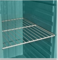
1 to 3 plastic coated steel shelves