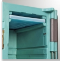
Moulded eutectic plate support