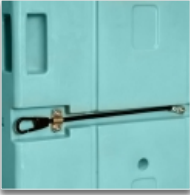
Door hold-open system, half-height door