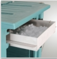
Dry ice drawer