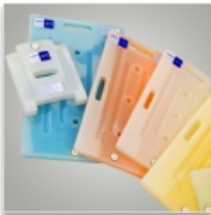
TOP 900 eutectique plate