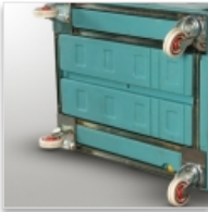
Rustproof treated steel frame, flush mounted, 4 wheels Ø 100 mm, 2 fixed, 2 swivelling