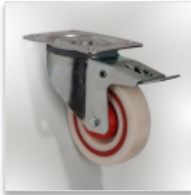
2 braked casters Ø 100 mm