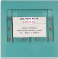
Embedded label holder