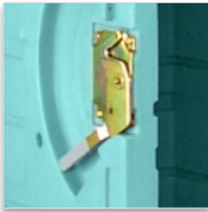
2-points «pelican» quick closing system, rustproof treated