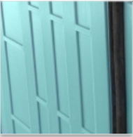
EPDM one-piece frame seal