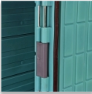
Double axles door hinge. Door opens to 270°