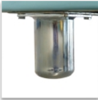
4 metal feet Ø 60 mm