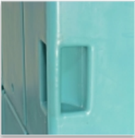
2 embedded moulded handles