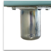
4 metal feet Ø 80 mm