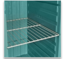
1 to 3 plastic coated steel shelves