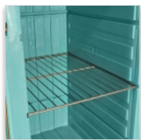
1 to 3 stainless steel shelves