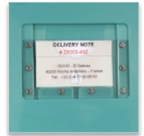
Embedded label holder