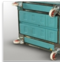
Rustproof treated steel frame, flush mounted, 4 wheels Ø 125 mm, 2 fixed, 2 swivelling