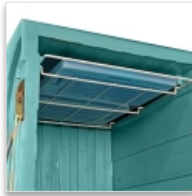
Eutectic plate holder