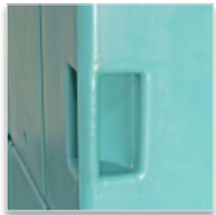
2 embedded moulded handles