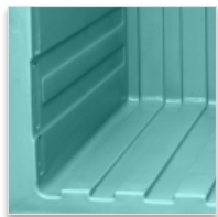
Monobloc rotomoulding. Internal convection grooves