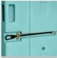
Door hold-open system, half-height door