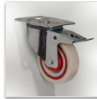
2 braked casters Ø 125 mm