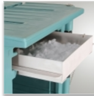
Dry ice drawer