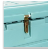
One embedded fastener, can be lead-sealed