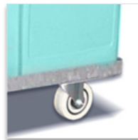
Removable castor base with 4 wheels Ø 100 mm, 2 fixed, 2 swivel