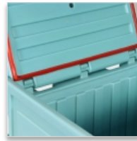
Box/lid articulation moulded, opening 115°