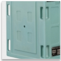
8 moulded handles