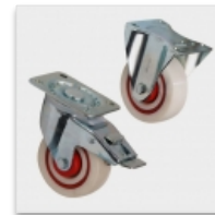
Removable castor base with 4 swivel wheels Ø 100 mm, including 2 with brakes