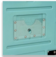
Embedded label holder