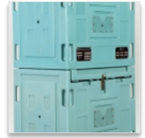
Embossed bottom and lid from moulding for stacking