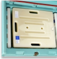
Moulded eutectic plate holder