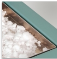
Dry ice drawer