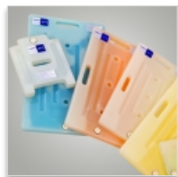
TOP 130 eutectic plate